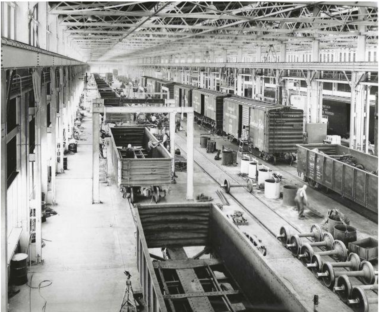
CNW car shop- fabricating and erecting shop- in Clinton Ia. Photo takes in 1957 (before roller bearing axels). Building was over ½ mile long. Nothing remains today.