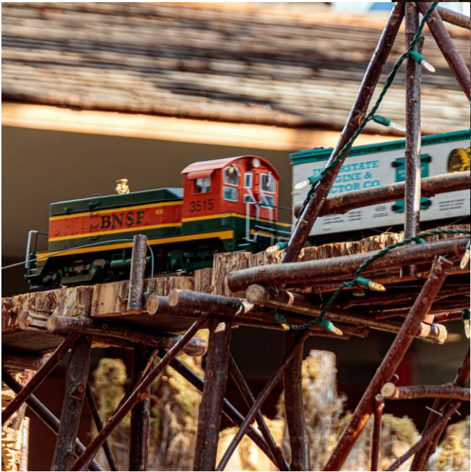
Reiman Gardens featuring our popular “RG Express Holiday Train” display. Visitors will be enchanted by this custom-built garden-scale train